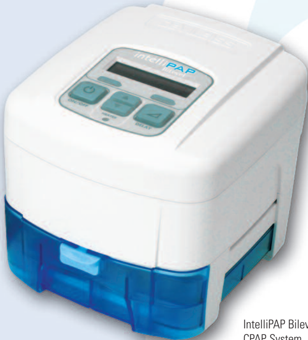
IntelliPAP Bilevel S CPAP System (Model DV55D-HH)

Once again, you talked. We listened. Everyone gets what they need.