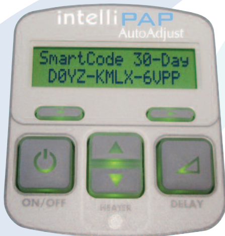
DeVilbiss SmartCode as displayed on IntelliPAP